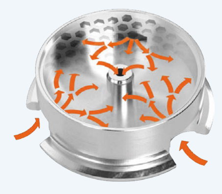
Gas flow inside the lower plunger

The lower plunger with perforated plate allows for electrochemical characterization of gas diffusion electrodes used for instance in Li-air batteries. The lower electrode is contacted by and "breathes" through the perforated stainless steel current collector supporting it. During operation, the pressure gradient